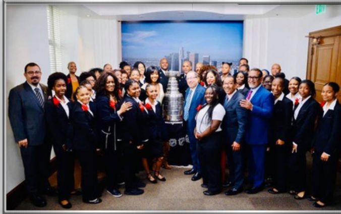
Councilmember, Los Angeles City, District 5